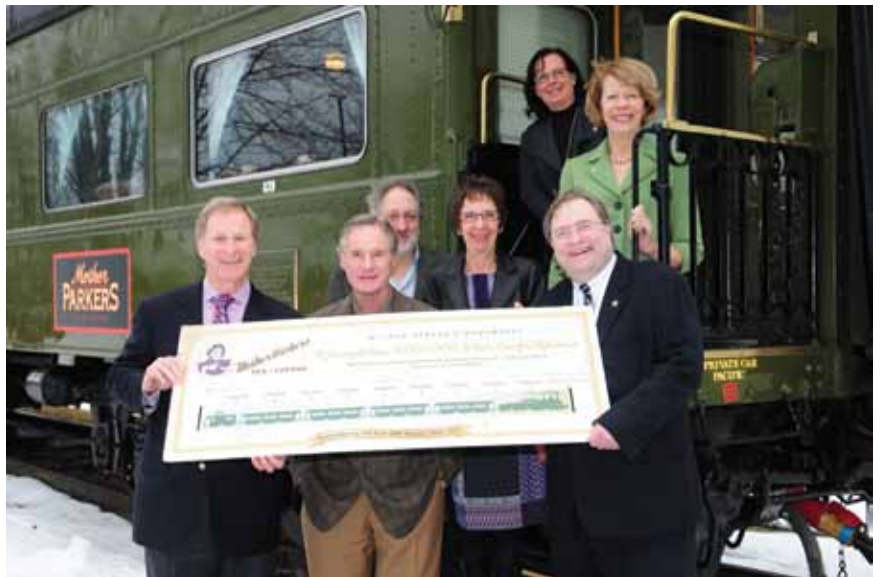
Mother Parkers donates $1 million to advance biomedical research into the causes and cure for Alzheimer's disease, and find better treatments.